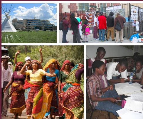
A Guide for Trainers